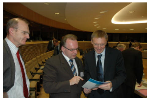
ECRN President Dr. Reiner Haseloff and Commissioner Janez Potočnik

It is therefore obvious that a follow up process to the HLG has to be in place